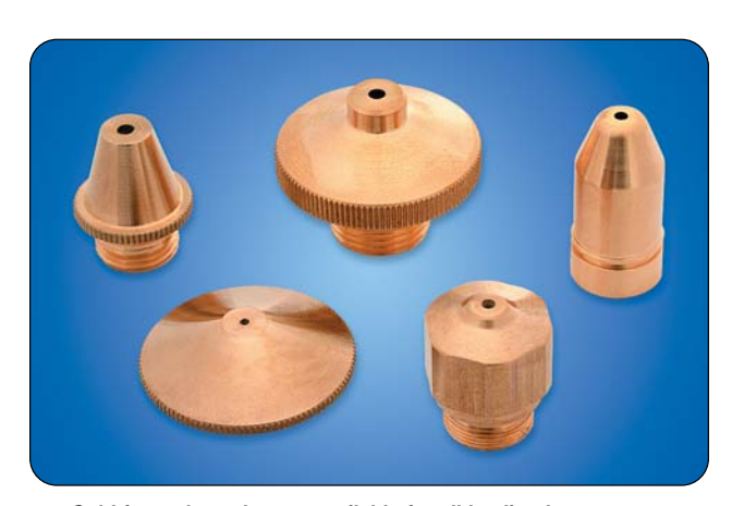
Cold formed nozzles are available for all leading laser cutters.